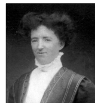
Wedding Photo (1908)