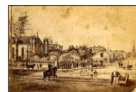
St Francis's Church, Melbourne (1841)